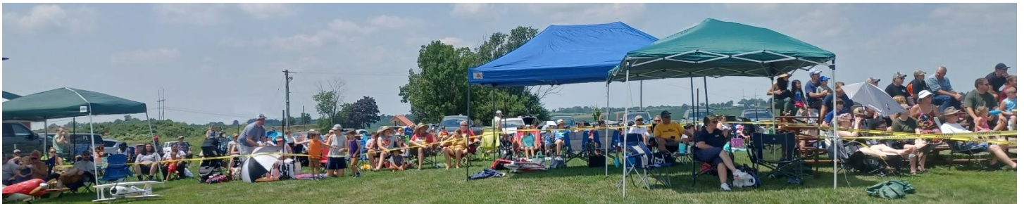
July 13 th 2025: 2:00p.m. – South, Standing Room Only