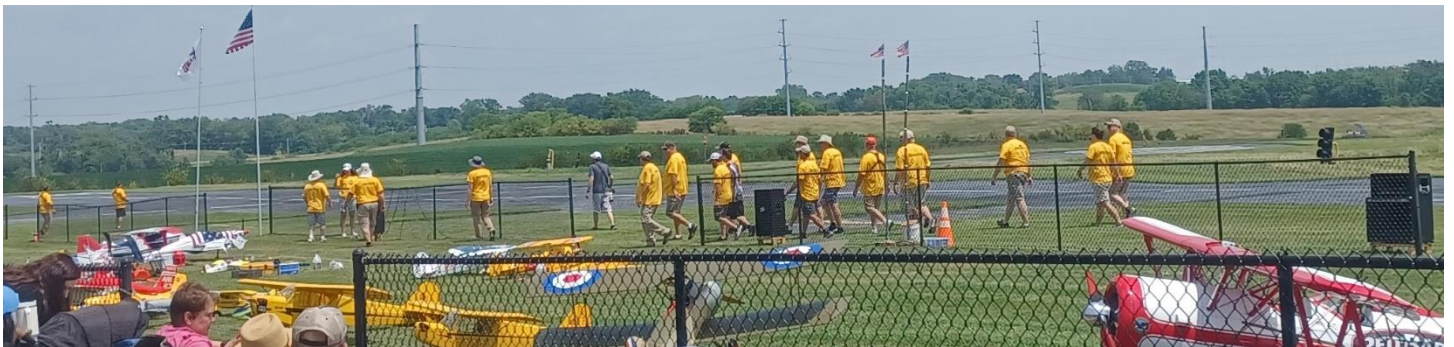
July 13 th 2025: 1:15p.m. – Procession of Pilots

Thank you to all pilots participating in the 2025 Air Show