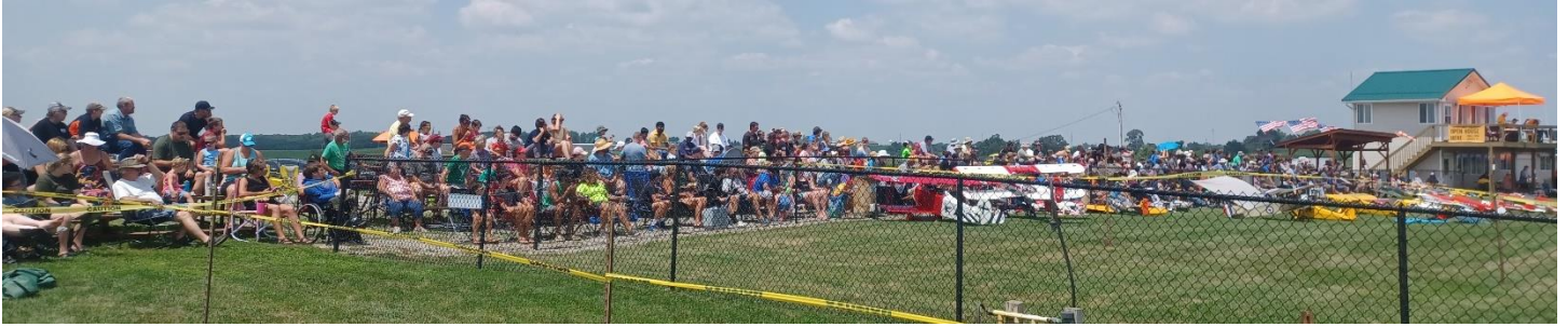
July 13 th 2025: 2:00p.m. – North, Bleachers